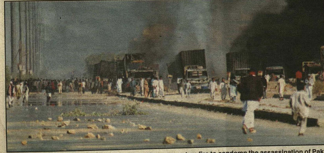
FURY: Protesters block a road next to trucks that were set on fire to condemn the assassination of Pakistan's former Prime Minister Benazir Bhutto during a demonstration in Karachi.