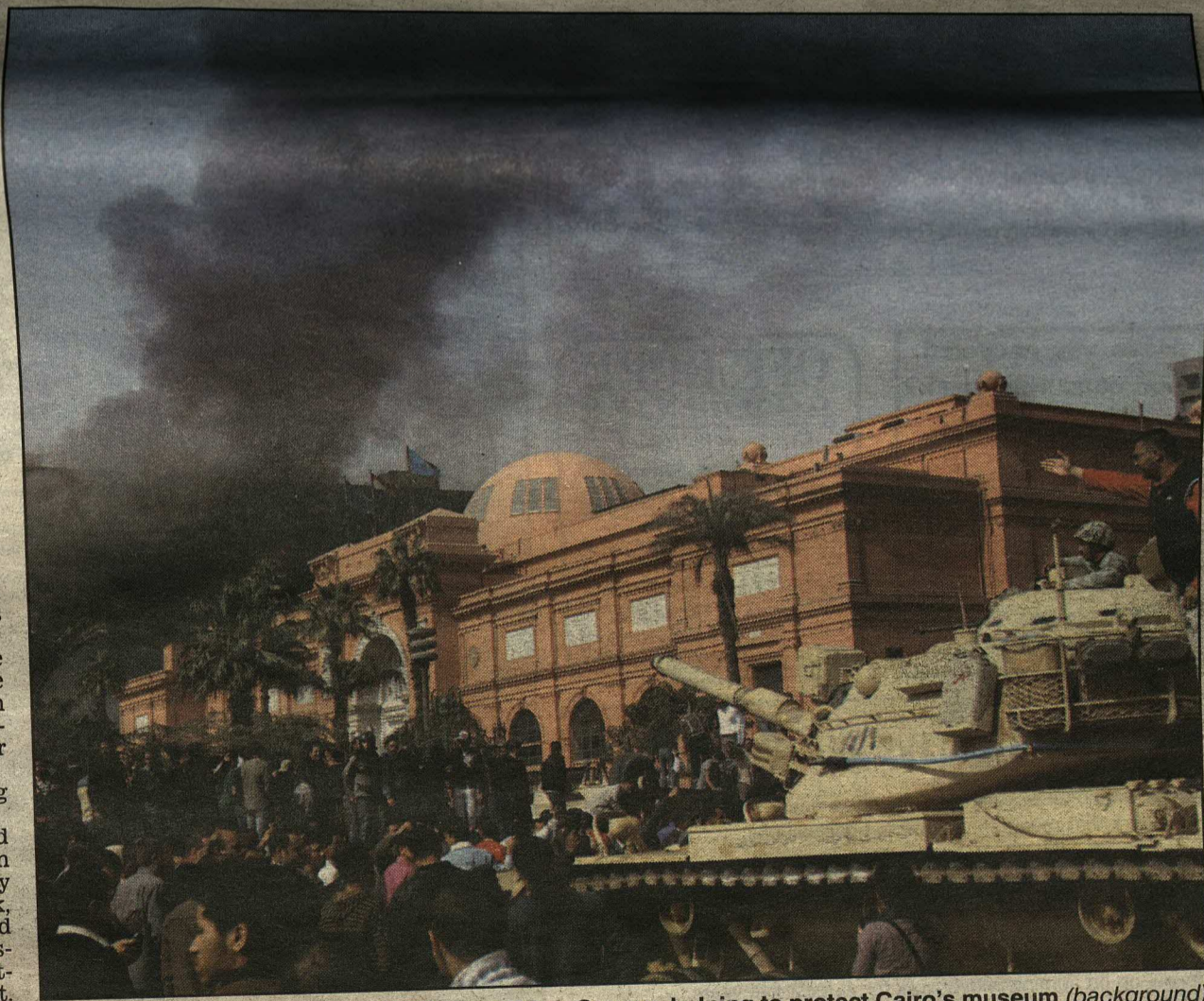
Egyptians gather next to a tank in Cairo's Tahrir Square, helping to protect Cairo's museum (background) from looters as smoke billows from the headquarters of the ruling National Democratic Party

It was not clear if protesters would welcome a move that keeps control in the hands of the military and security institutions. "He is just like Mubarak, there is no change," a protester told Reuters outside the Interior Ministry, where thousands were protesting, moments after the appointment. "We are not demanding a change of